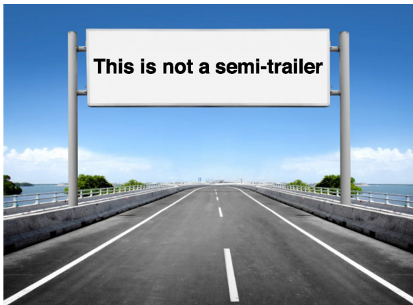
Fig. 4 What is it?