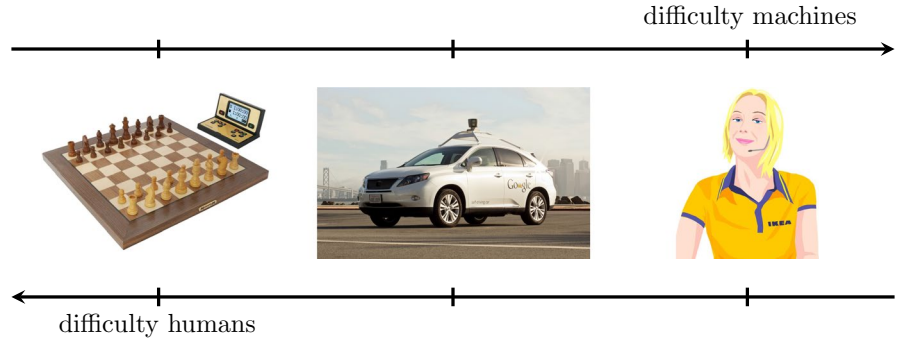
Fig. 1 For many classes of tasks, their relative complexity is opposite when seen from a machine perspective and when seen from a human perspective

The difference between human intelligence and current level machine intelligence is so large that it is probably more relevant to talk about a duality. We humans have a very flexible intelligence, are good at abstract thinking and conceptualising the world. Often we are good at solving problems that are not very clearly delimited and well-structured (but where the solutions do not have to be either). Conversely, machines are primarily good at clearly delimited and well-structured problems, but can then also provide solutions that are very precise and well-structured. They are much less competent at abstract thinking and conceptualising the world, though a lot of research is invested in developing AI systems that have these competences as well.