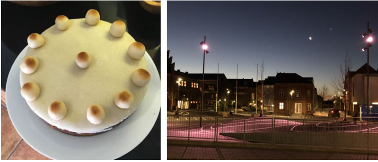
Fig. 2 Two pictures that were blocked by the image recognition system of Instagram

to bear many similarities, and they seem to be fairly acceptable pictures from everyday situations. However, they were both blocked by the image recognition system of Instagram (in 2015 and 2019, respectively), and both were claimed by the system to contain unacceptable nudity. There is currently no way of knowing exactly why these pictures were labelled as unacceptable, as the neural networks train an implicit model with millions (or even hundreds of millions) of neuron weights, and it is the combination of all these neuron weights that decide the classification the network makes. There is also no simple way of telling the neural network that easter simnel cakes like the one on the left of Fig. 2 are not examples of human nudity. The only way to try avoiding such misclassifications in the future is to provide the algorithm with more labelled pictures that it can train on—and then hope for the best. This is clearly very different than the situation in symbolic AI, where models are explicit rather than implicit, and can hence easily be inspected and modified.